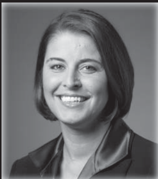
Joanne P. McCallie